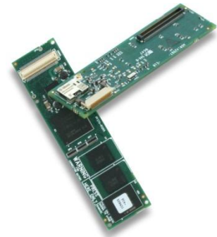
6.1. Picture Gumstix

It was decided not to do any of the processing on the Gumstix devices as this could cause a slowdown in processing the data. Also, if the data is only sent out in a raw form then the base station has greater scope of what it can do with it, whereas if it was received in a processed form, parts of information concerning it could be lost. This helps in terms of extending the system at a later date, as only the base station code would need to be changed (assuming no different types of sensors needed to be added).